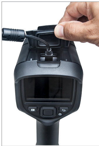
Download images fast via USB.

Specifications are subject to change without notice. For the most up-to-date specifications, go to www.flir.com