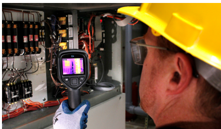
Variable emissivity and reflected temperature parameters give you reliable results fast