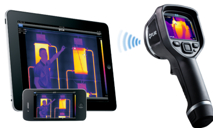
Wireless connectivity to smartphones, tablets and more.

*After product registration on www.flir.com