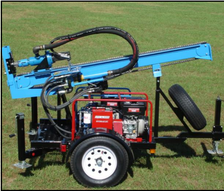
Mast Folds for Travel