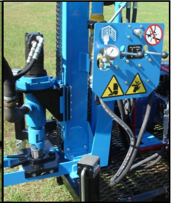
Rotary & Control Valves