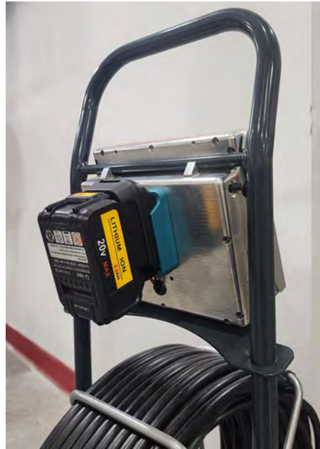
Dewalt with adapter