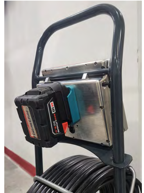
Milwaukee with adapter