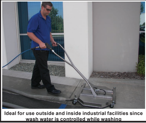
Ideal for use outside and inside industrial facilities since wash water is controlled while washing