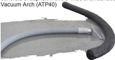
6' Foam Rubber Sand Berm (ZMAT7)

The Hydro Vacuum Arch is an easy way to recover water. Lay it on the ground, connect a vacuum source (75 - 200cfm) and it will create a vacuum wall along the bottom edge to suck up the water. Suitable for concrete or asphalt with a 5' wide even surface. Hydro Vacuum Arch (ATP40)