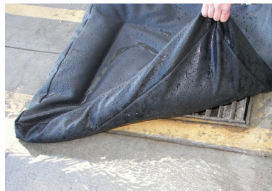
Drain Pillow 3' x 3' (ZMATD)