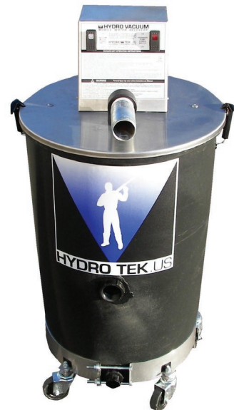
shown with caster option