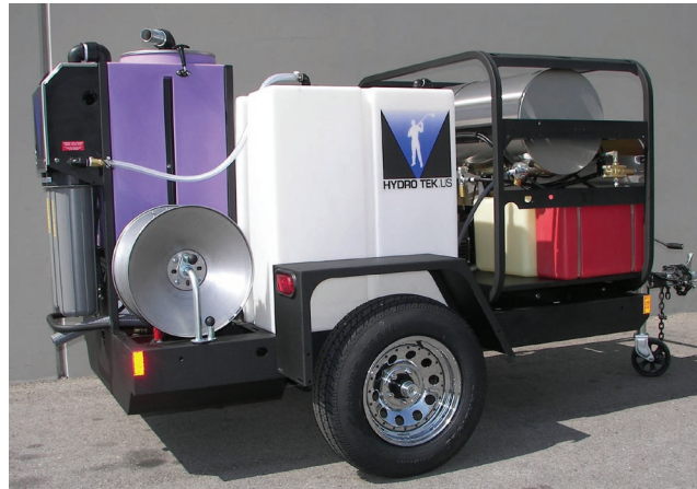
AZV is factory plumbed and installed when ordered on a Hydro Tek ProTowWash® trailer